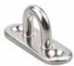
SS Eye Plate

Acoustic Design Lab offers several mounting options including stainless eyebolt brackets, brushed nickel U-Brackets plus optional Made in USA custom adjustable architectural grade aluminum extrusion with the 12mm H-Track